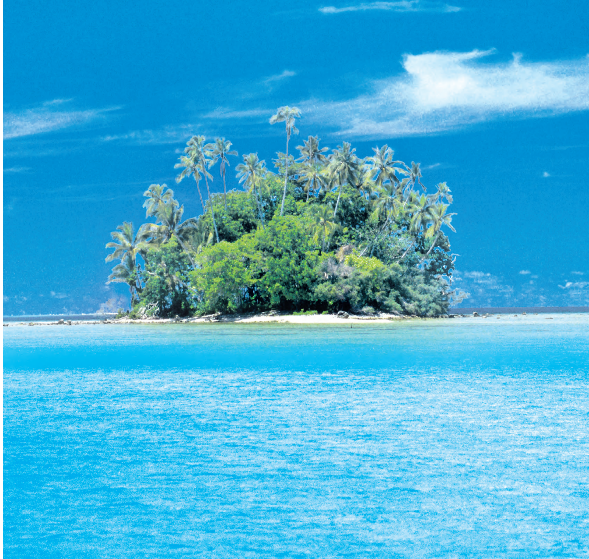
Photo of an uninhabited island in the Solomon Islands

www.teakwarehouse.com / Open Daily 10 - 6 / 310.536.8325 / 2653 Manhattan Beach Blvd., Redondo Beach Everything comes fully assembled and is in stock. Sunbrella® Cushions are free with deep seating purchases as shown on our website.