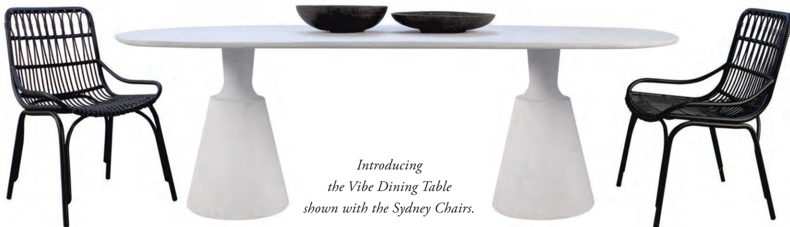
Introducing the Vibe Dining Table shown with the Sydney Chairs.