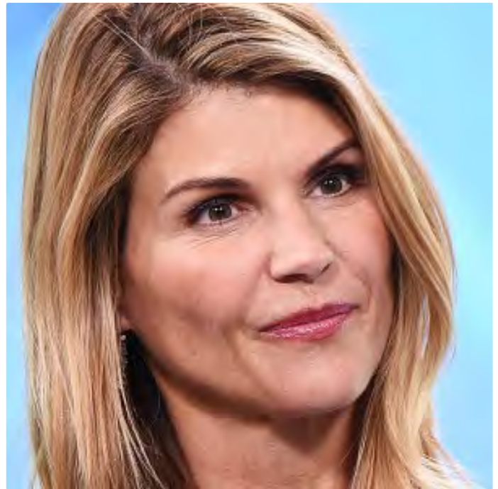
The Final Nails Driven Into Lori Loughlin's Hollywood Coffin