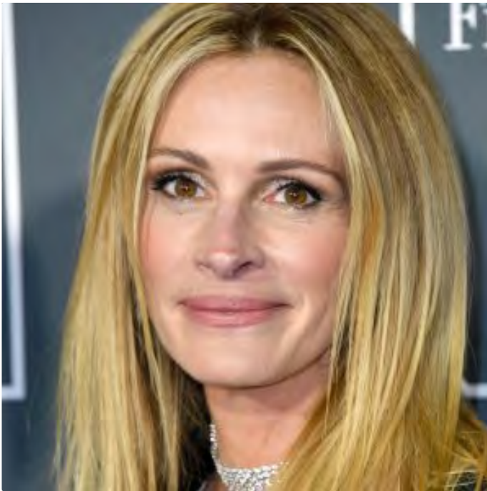
Julia Roberts Nails What May Be Saddest Part Of Admissions Scam