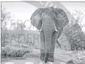
Size matters when two forces meet. Flapping ears tells us to back off and give him space at the South Luangwa National Park, Bushcamp Company, Mfuwe, Zambia.