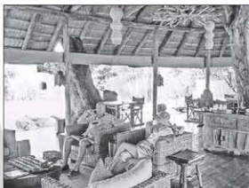
Bilimungwe Lodge, more rustic comfort homemade in Africa, is crafted out of logs, planks, reeds and thatch.