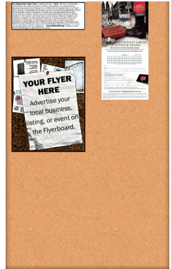
Local display advertising by PaperG

The lions that killed and ate the buffalo, the bush babies in the Mahogany tree and the discovery – to our mutual astonishment – that our fellow guests, a couple from England, live next door to my English cousins.