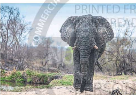
Flapping ears tells us to back off and give this guy space at the South Luangwa National Park.