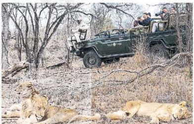
Expert trackers Lazarus and Louis find gold: a pride of lions sleeping off dinner near Earth Camp Lodge, Sabi Sabi Private Game Reserve, South Africa.