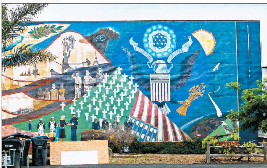
Eliseo Art Silva's "The Price of Freedom" pays tribute to the men and women who served, fought and died during the 20th century's armed conflicts. The mural, created in 2000, is one of many in Lompoc, California.

The La Purisima Mission ("Purisima" is one of several Chumash languages) is depicted twice, and the name of the town, founded in 1884, as a temperance community, also remembers its origins: "Lom-poc" is a Chumash word for "lagoon," or "still water."