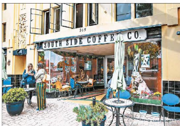
Need advice on what to see? Ask the friendly staff at South Side Coffee Co., in Old Town, serving breakfast, lunch and, of course, coffee.