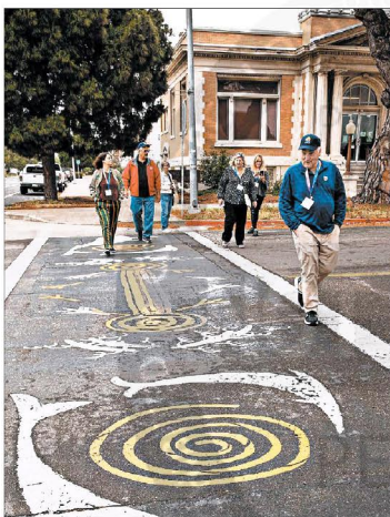
Lompoc is known for its art and a culture that supports creative design in every form, from murals to crosswalks.