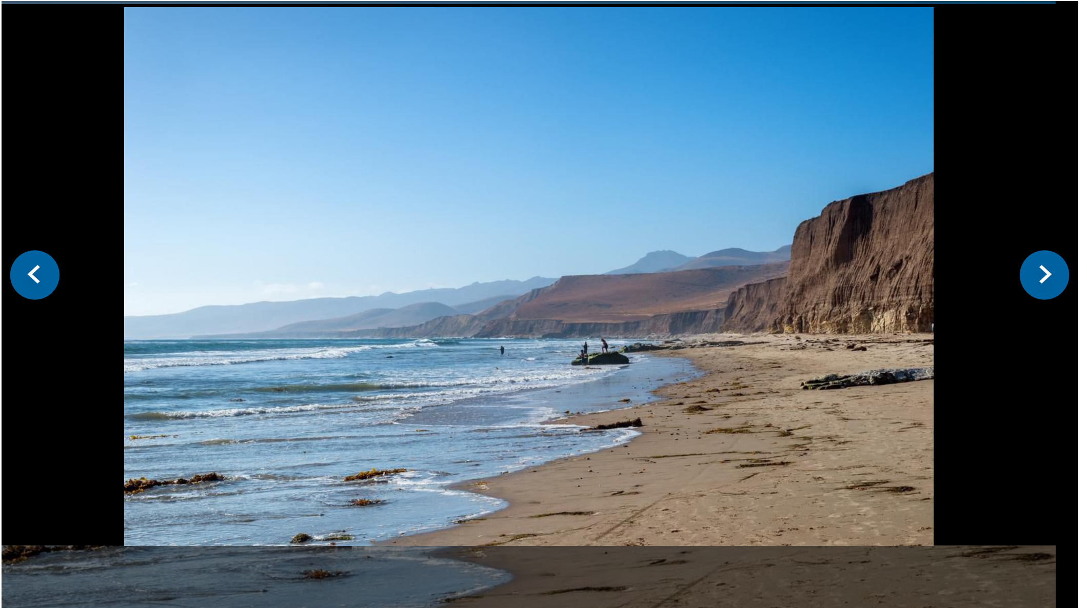
LOMPOC, CALIF.—I thought I'd seen everything.