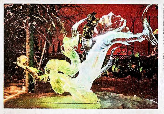
ICE CARVING: A mermaid sculpted in ice at the annual competition in Fairbanks