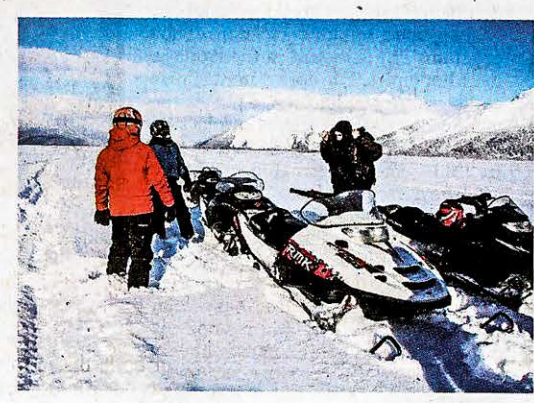
BREAK TIME: Snowmobilers tour the Placer River Valley in the Chugach Mountains.

p.m. the aurora borealis flickers over the city park where the annual Ice Carving Competition is held. Teams of carvers, each issued a dump-truck-sized chunk of ice sawn out of the Tanana River, set up their ear and, working by spotlights, wield saws and files late into the night. The ice is crack-resistant but hard, easily carved into fragile forms: flowing strands of identical glowing shapes. By hair, a horse's prancing legs, Arctic Circle. The next