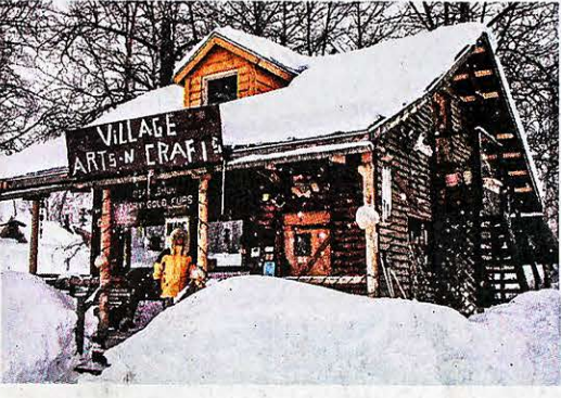
TALKEETNA: Shops, pubs, inn and the Denali National Park Visitors' Center stay open year-round.

As Alaska's most northerly large town, Fairbanks is home for many arcticbound outfitters and small plane companies. Calling around reveals that the Northern Alaska Tour Co. has two unsold seats on a trip to Coldfoot, north of the