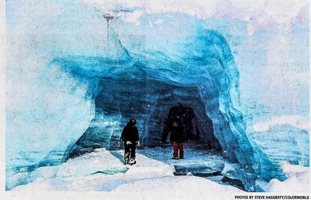
ICE CAVES: Snowmobilers explore blue tunnels made by melting glacial water.

As evening falls over Fairbanks, clouds of tiny ice crystals in the air refract lingering rays, creating rarely seen "sundogs," pairs of