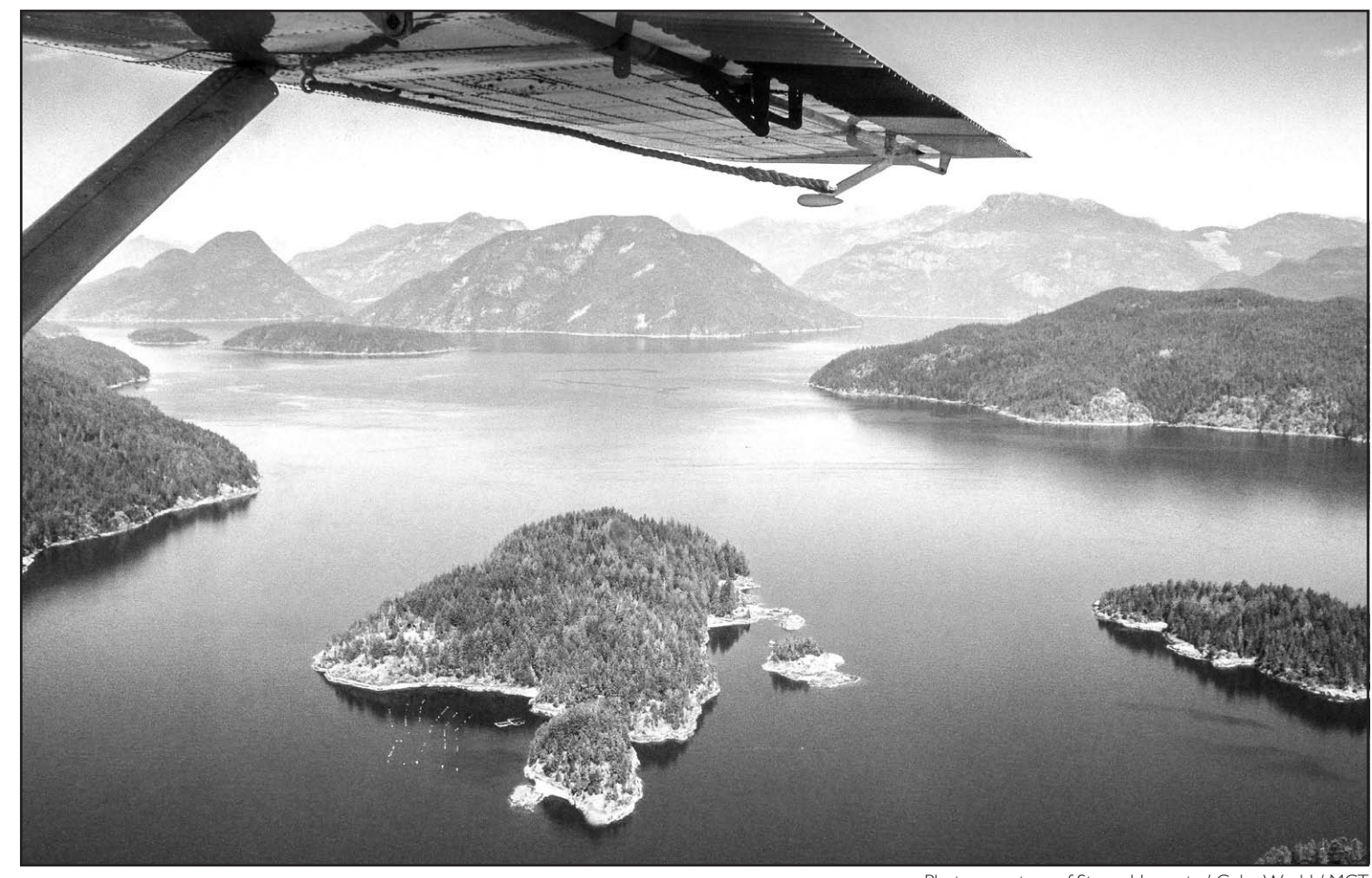
CorilAir pilot Mike Farrell flies low over the Discovery Islands, east of Campbell River, Vancouver Island, B.C.

Wandering through Nanimo we ate lunch at Troller's Fish and Chips, a guidebookrecommended restaurant that took us 20 minutes to find, but that more than lived up to its reputation. Heading west