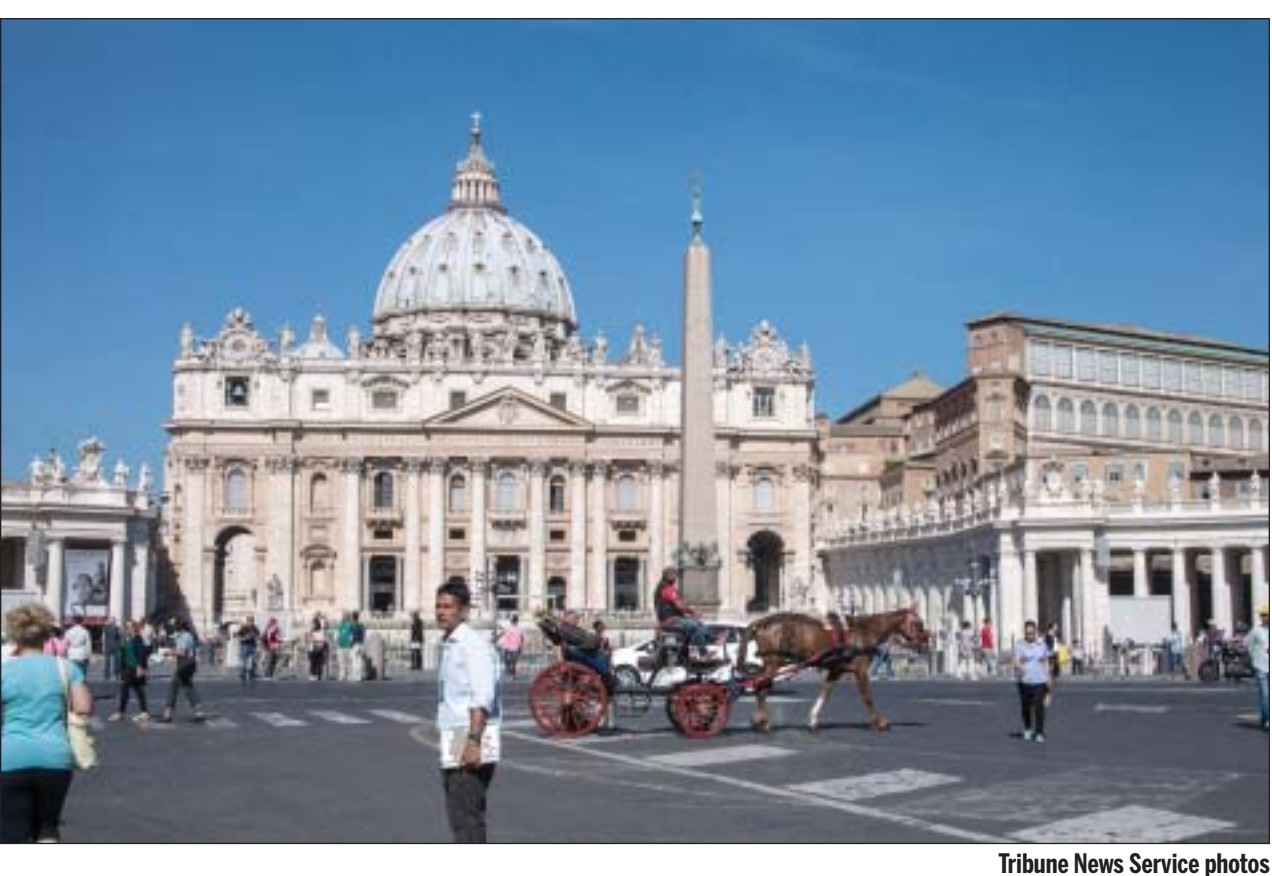
The early-morning crowd at St. Peter's Cathedral isn't as dense as it gets later in the day.