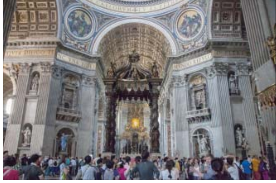
Crowds in St. Peter's Cathedral in Rome push up to the railing in front of the Baldachin and main altar.

That means jostling crowds, straggling groups and massive lines. But flash your Omnia & Roma Pass and you're through the gate and into the Coliseum, where gladiators really did bludgeon each other to death. Or into