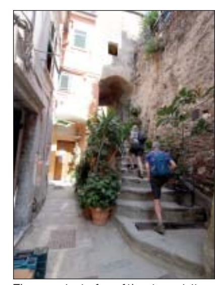
These are just a few of the steps visitors have to climb as they travel between villages in northwestern Italy.

Happily, Vernazzo and Monterosso offer fine swimming, too, so once you've worked up a sweat hiking, you can cool off in the sea. We