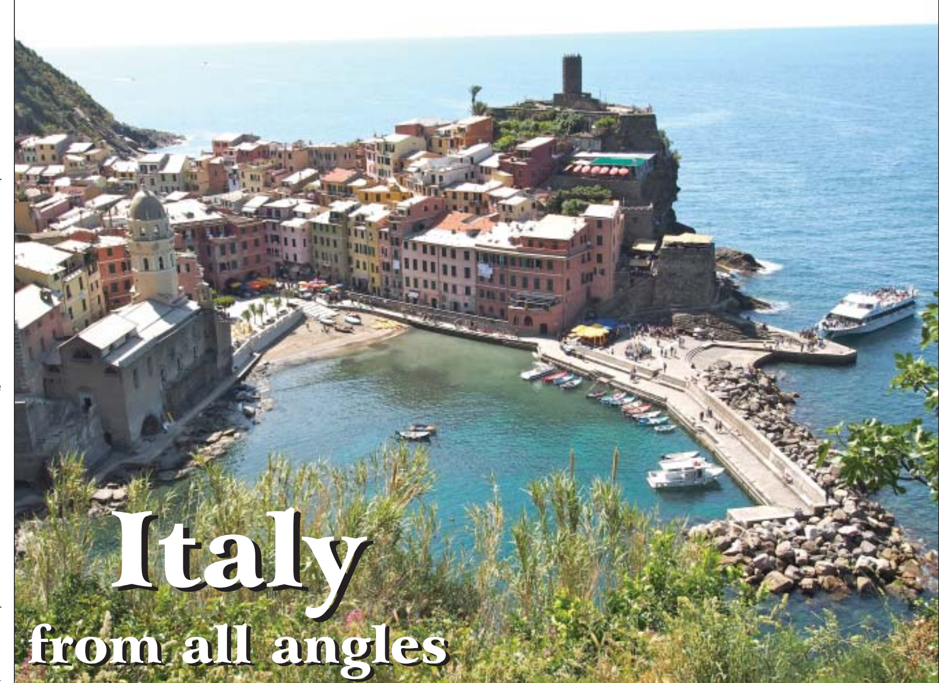
Above: The town of Vernazza juts into the Mediterranean Sea in the Cinque Terre region of northwestern Italy. Below: Manarola, another Cinque Terre town, glows in the light of a spring sunset. Adventurous hikers can walk from town to town on this stretch of Italy's Mediterranean coastline.

Many hotels on Las Vegas Strip offer more exclusive (and expensive) room options