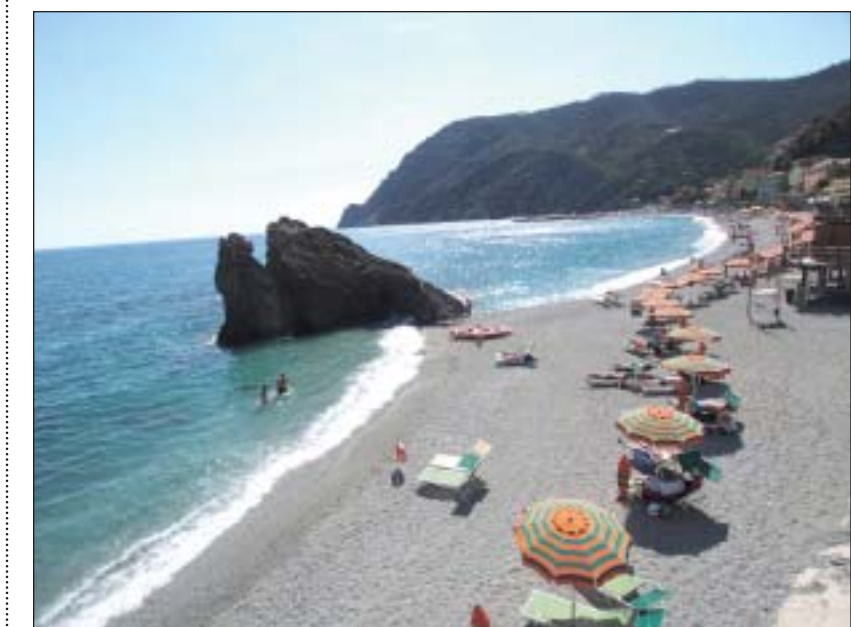
Sunbathers flock to umbrellas set up on a beach in Monterosso, one of the five small cliffside villages in Cinque Terre.