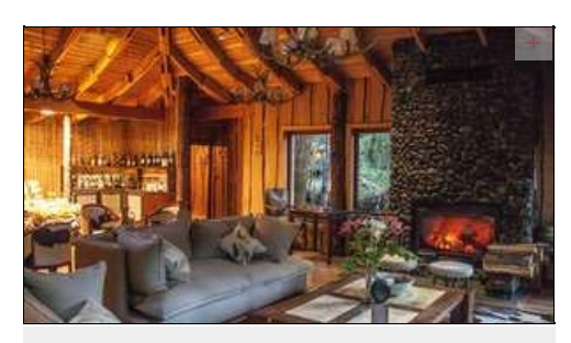
Intimate lodging and dining is the trademark of Nawelpi Lodge (Puma Lodge), at Huilo Huilo, Chile.

trails, the Rio Fuy and Lake Pirehueico promote hiking, fishing, kayaking, easy and risky whitewater rafting, birding and horseback riding.