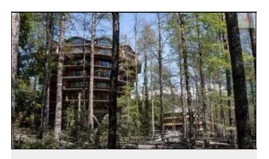
The Hotel Nothofagus — so-named for a genus of southern beech trees — is the largest of Huilo Huilo's four hotels, ... Read More

If any doubt remains, Huilo Huilo's tourist map, a "Where's Waldo" visitor guide, proves the point. Done up in comic book colors and crowded with cartoon figures, it's chock-a-block with visitor services, nature trails, ski slopes, trout streams and hotels built to blend into the undergrowth.